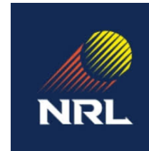
Numaligarh Refinery Limited Numaligarh