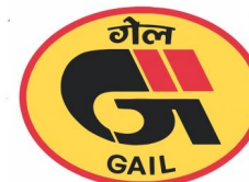
Gas Authority of India Limited (Apprentice)