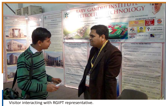
Visitor interacting with RGIPT representative.

RGIPT also participated in an education exhibition, organized as part of “Vibrant Gujarat Summit 2013” in Gandhinagar by Government of Gujarat from 8 th -13 th January, 2013 and put up a stall with the objective to bring awareness among students and professionals of Western India and attract them to join RGIPT. Numerous state and national level institutions and companies had participated in this week long exhibition and several thousands of people including college and school students came to see the display.