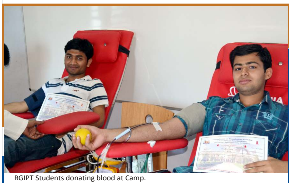
RGIPT Students donating blood at Camp.

RGIPT Student Chapter of SPE (Society of Petroleum Engineers) and institute's social wing “Arpan” jointly organized a blood donation camp “Ardaan” on 16 th March, 2013 with the support of King George's Medical University (KGMU), Lucknow.