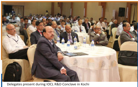
Delegates present during IOCL R&D Conclave in Kochi