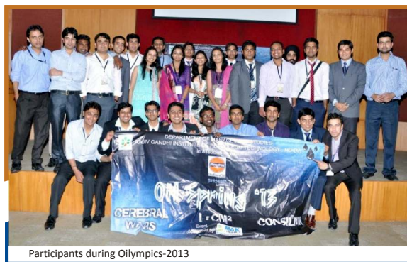
Participants during Oilympics-2013